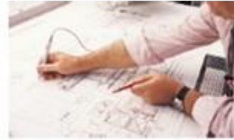
The Super L VI is ideal for your most demanding work!