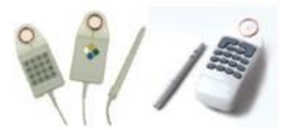
Choice of pointing devices (see features)